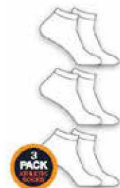
ATHLETIC SOCKS WHITE