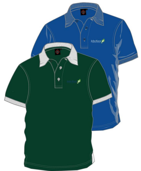
UNISEX POLO SHIRT S/S GREEN | ROYAL