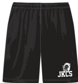
UNISEX GYM SHORTS BLACK