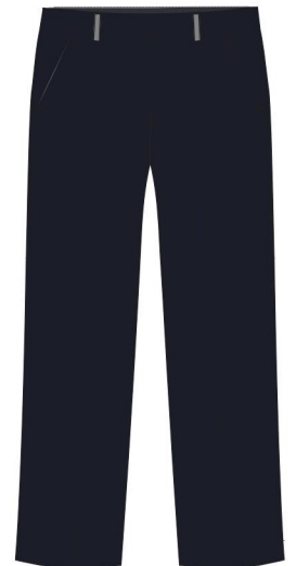
BOYS DRESS PANTS BLACK