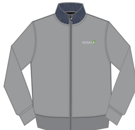
UNISEX POLAR FLEECE FULL ZIP BLACK