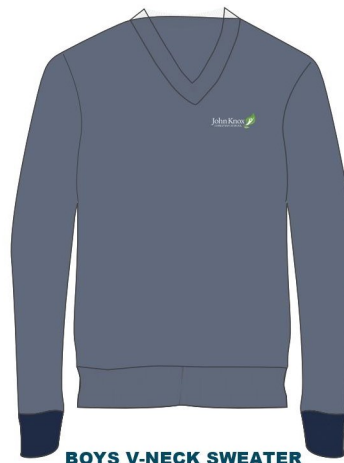
BOYS V-NECK SWEATER GREY