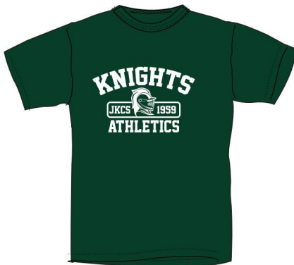
UNISEX GYM T-SHIRTS GREEN / ROYAL