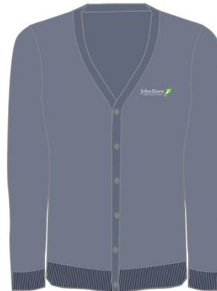
GIRLS CARDIGAN GREY