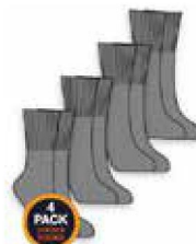
UNISEX SOCKS GREY