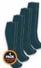
KNEE SOCKS GREEN